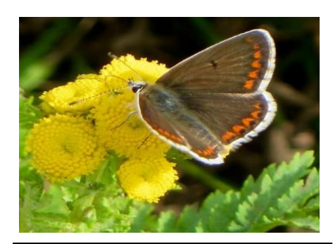
Brown Argos on The Hook in 2022

The 2 species that were new to us in 2022 were the Small Copper and the Brown Argos.