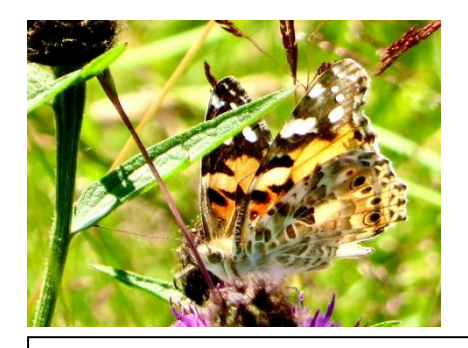
Painted Lady on The Hook in 2022

The other species recorded, in smaller numbers, are: Green Veined White, Large Skipper, Essex Skipper, Red Admiral, Common Blue, Brimstone and Painted Lady.