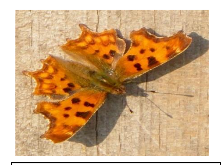
A Comma, sunning itself on the bench near the pond

The species that we have recorded in the greatest numbers over the 3 years (starting with the most numerous) are: Small White, Large White, Orange Tip, Ringlet, Gatekeeper. Speckled Wood and Small Tortoiseshell. There are also reasonable numbers of Peacock, Comma, Small Skipper, Meadow Brown and Holly Blue.